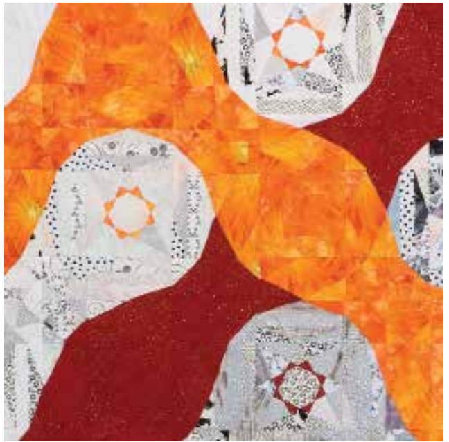
Entwined, 64" x 48" - Detail

Trefethen's work is exhibited internationally. Examples of her work can be found in multiple publications and on the web. In 2010 her work was featured on the title page of 500 Art Quilts (Lark 2010). Trefethen lectures, teaches and creates work on commission. To learn more about Trefethen or view additional work by her, visit www.gwynedtrefethen.com .