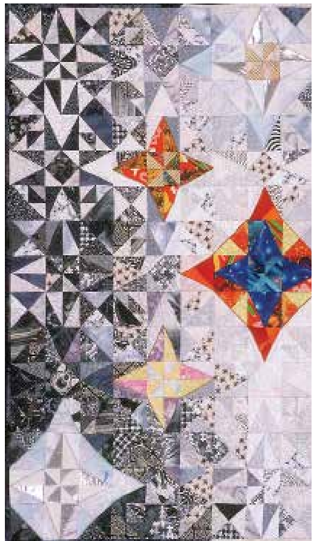
Hope Springs Eternal, 30" x 18"