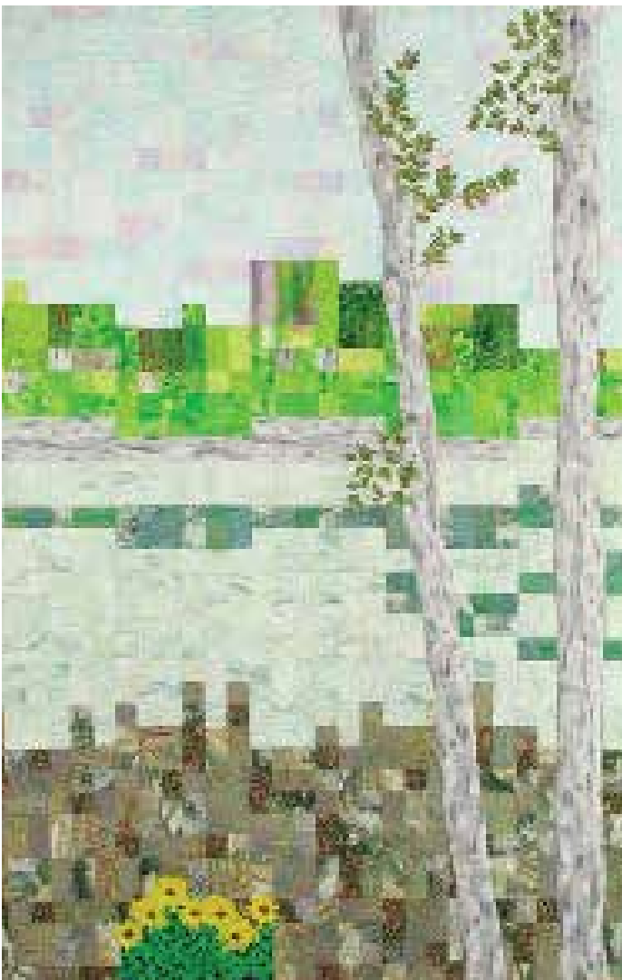
Little Lake Butte des Morts in Summer 44" x 30"