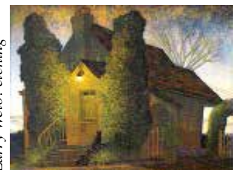
Larry Welo: etching