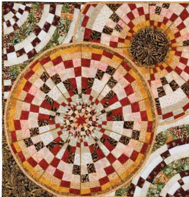
Botswana Bounty, 30" x 30"