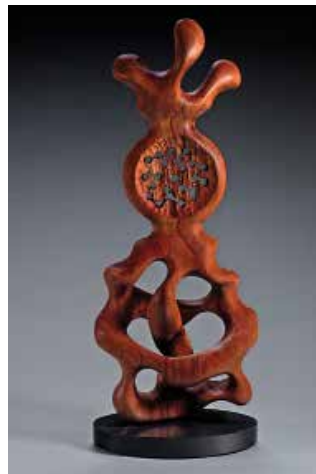
Spirit, Mahogany, 4"x8"x20"