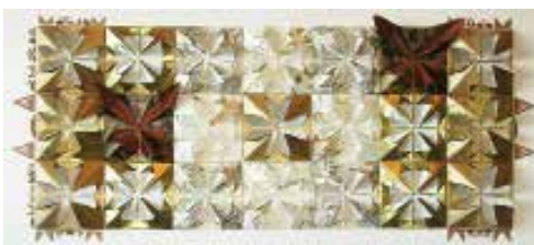
Tamlyn Akins: origami relief & colored pencil