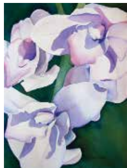
Peg Ginsberg: watercolor