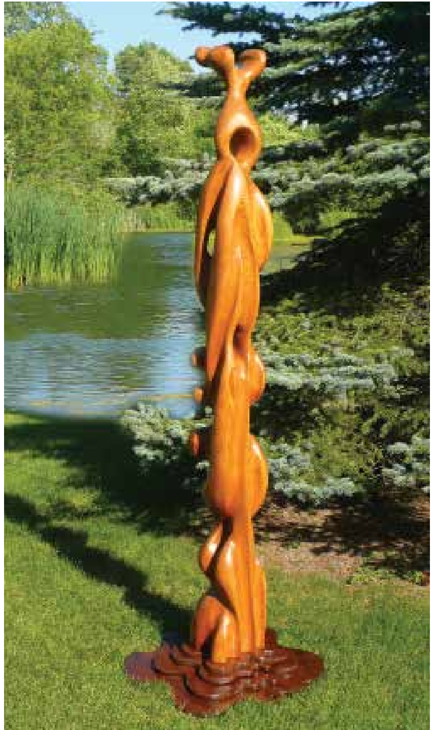
Big Cedar, Cedar, 6'x8"x8"