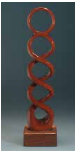
Ascension, Mahogany, 4"x6"x36"