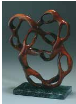
Round River, Walnut, 14"x4"x4"

See more of Tom's art online at: www.eddingtonart.com