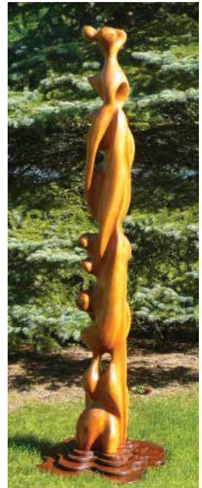
Big Cedar, Cedar, 6'x8"x8"