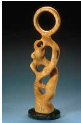
Satori, Butternut, 4"x7"x26,"