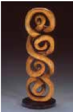
Non-Dual, Butternut, 4"x9"x30"