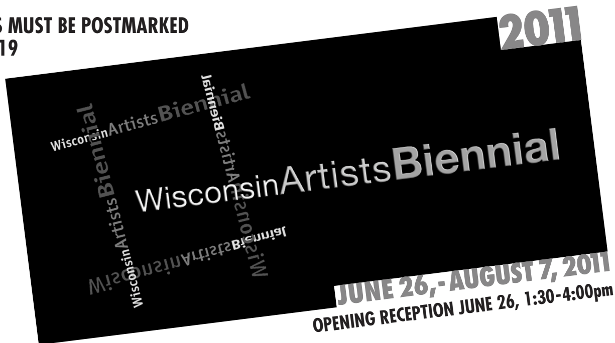
EXHIBIT VENUE: ANDERSON ART CENTER, KENOSHA, WI

ALL ENTRIES MUST BE POSTMARKED BY MARCH 19